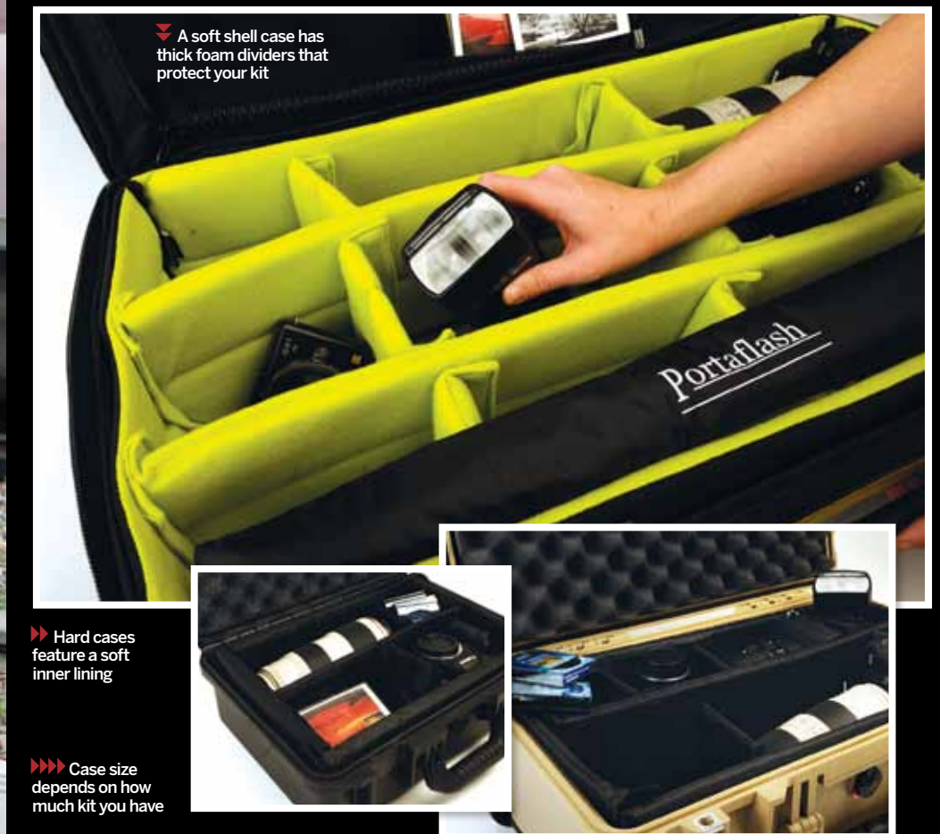
▶ A soft shell case has thick foam dividers that protect your kit

gear is stashed into a waterproof, dustproof case that will withstand the hazardous and unrelenting conditions. To keep the traveller's peace of mind in tact, here are our top recommendations for the jet-setting photographer.